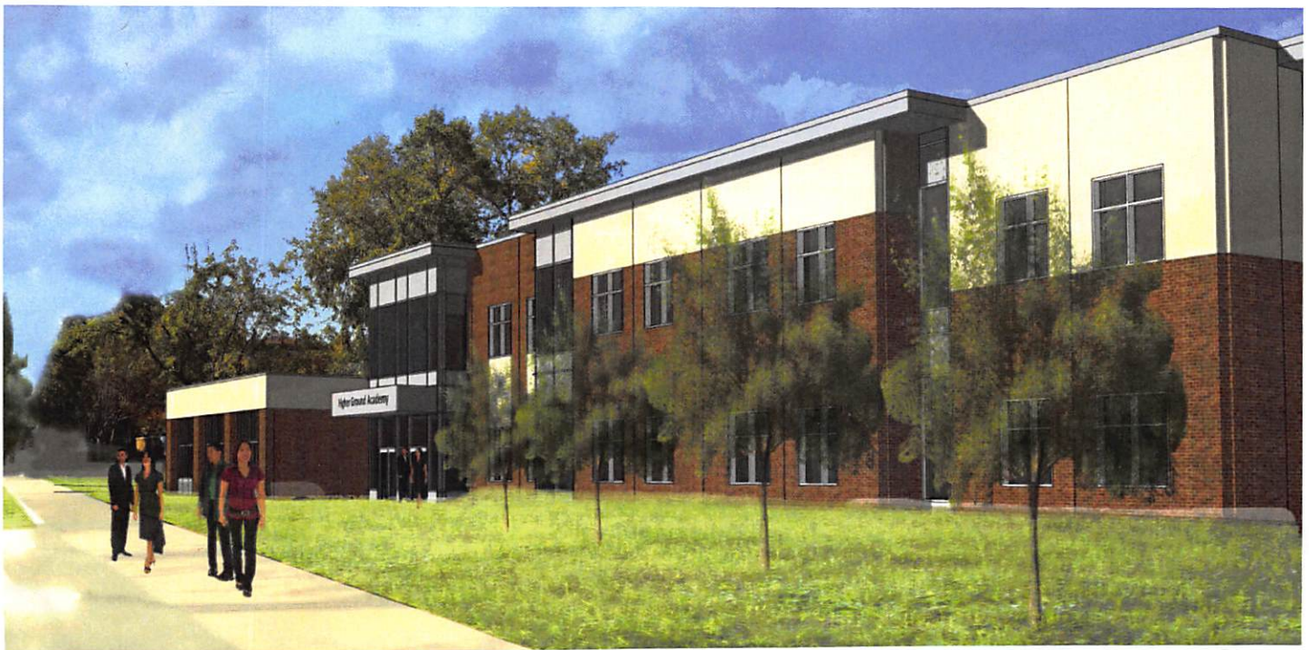
Proposed Exterior Concept for New Higher Ground Academy New Secondary School